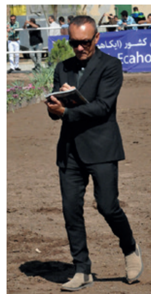
IRAN NATIONAL CHAMPIONSHIP KORDAN DC

show. I came up with a new project that was then called the Clinic of Handlers. In practice, it was a matter of transmitting to the participants a condensed set of rules and techniques for the preparation and presentation of the Arabian horse in a show. In one weekend, a preparatory course was held for amateurs who wanted to present their horse.