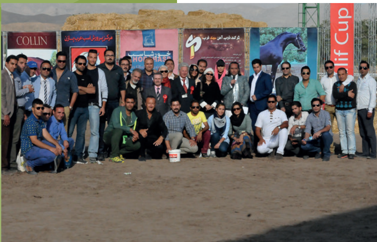
IRAN YAZD Clinic of Handler and participants