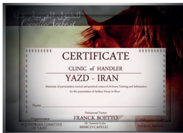
CERTIFICATE OF PARTICIPATION CLINIC OF HANDLER YAZD