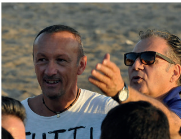
YAZD-IRAN CLINI DI HANDLER relaxing in the arena