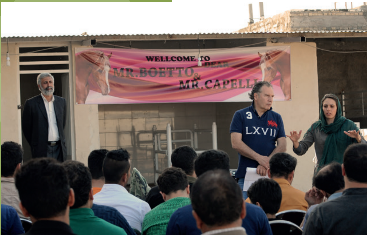
IRAN HAHWAZ Clinic of Handler with the Interpreter