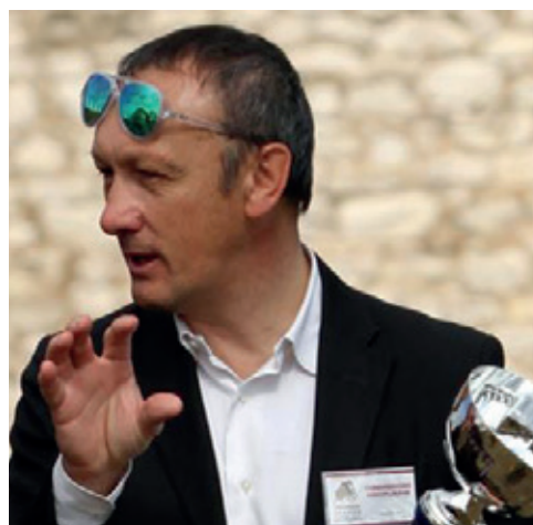
TRAPANI DC prize-giving