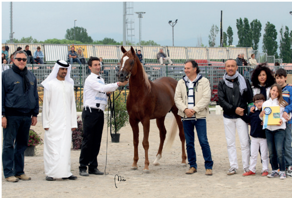
TRAVAGLIATO Colt Champion award to SE -CAYENNE T by Royal Colours