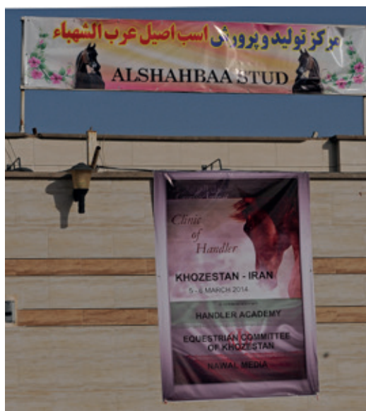
IRAN KOZESTAN Clinic of Handler