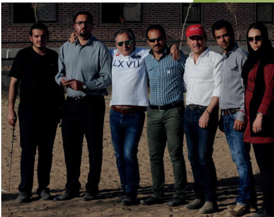
Iranian friends and breeders