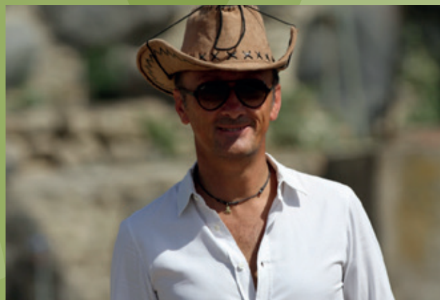
TAORMINA DC in the ring